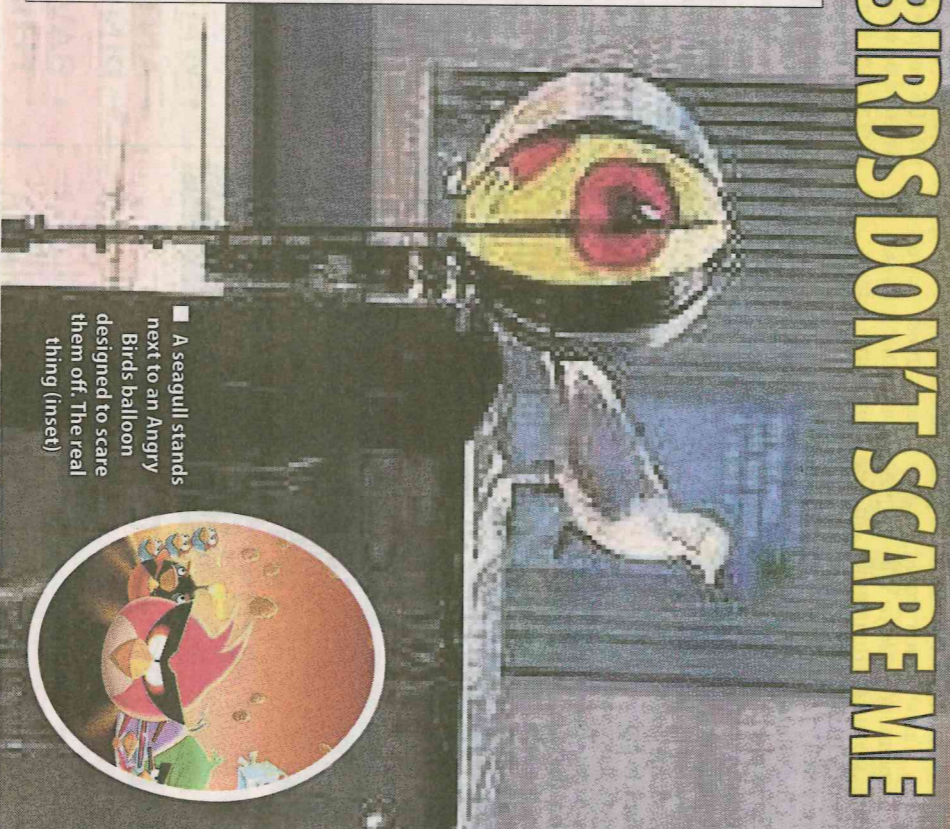
■ A seagull stands next to an Angry Birds balloon designed to scare them off. The real thing (inset)

The scare balloons were dotted around the High Street in a bid to stop the pests swiping food from shoppers. A council spokesman said: "We have anecdotal evidence to say that it has been a success the majority of the time. We will consider all the feedback to see whether we carry on or whether we need to look at doing something different."